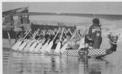
▶ GF7: Present progressive with future meaning (p. 155) • P 6-7 (p. 77-78) • WB 5-8 (pp. 50-52)